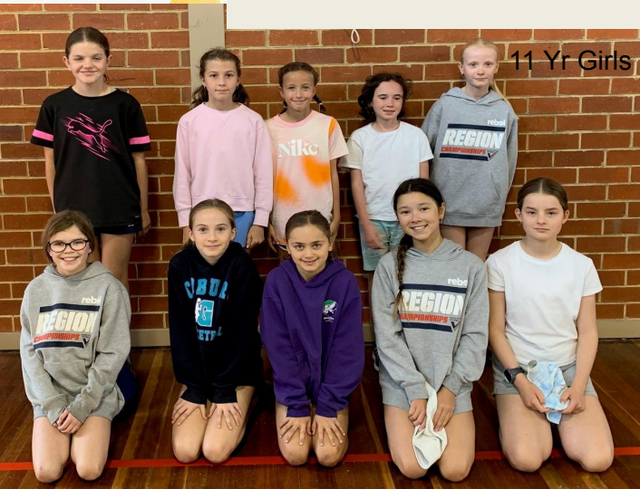
11 Yr Girls