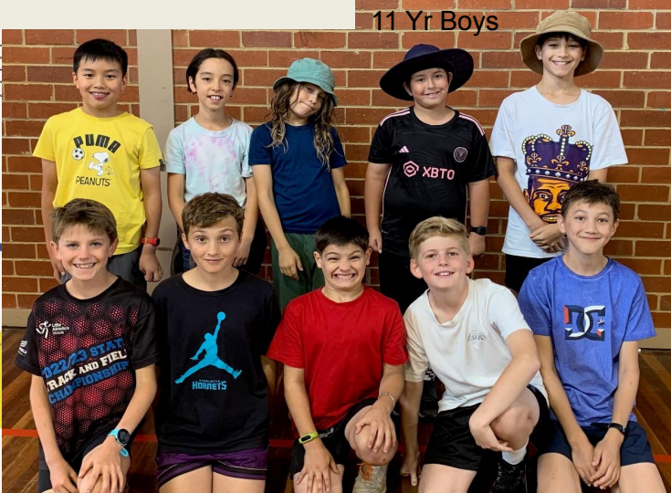
11 Yr Boys